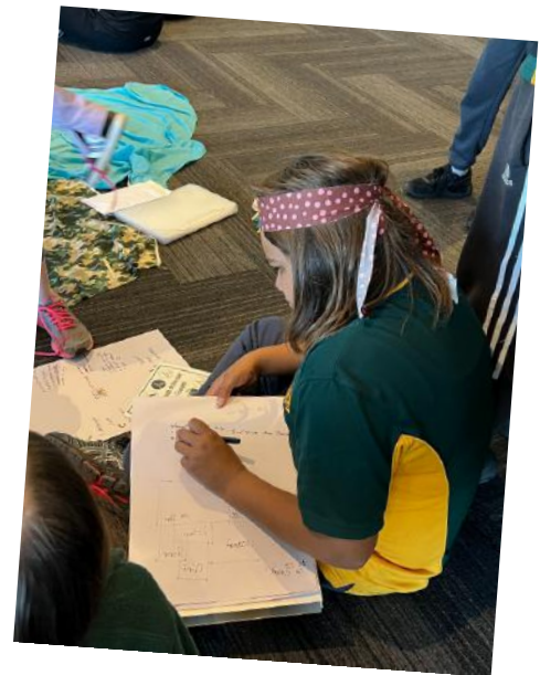
The values of being a good leader - Tate