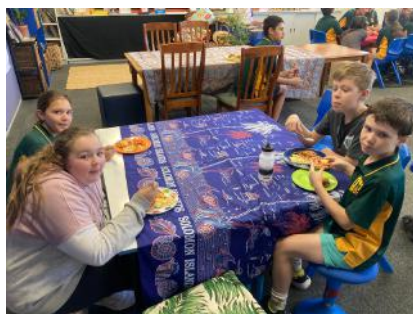
To celebrate our new learning community, Room 13 prepared and shared a delicious lunch earlier this term.